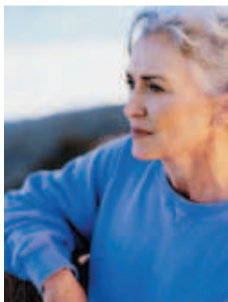
The collagen-like polypeptide is proven to reduce wrinkle depth by 15%

DKSH | DKSH comes up with five new products. Plascize L-2700 is a new non-ionic acrylic resin specifically designed for reshapeable hair styling compositions developed by Goo Chemicals . Thanks to a very good solubility in water and ethanol, and high solubility in LPG, the ingredient can be added to various hair cosmetics. Purecolla is a chemically-polymerized polypeptide based on an amino-acid sequence of natural collagen. Wrinkle reduction clinical studies demonstrate a reduction of 15 % of wrinkle depth. Exchanger is part of a new active line developed by Arclay Natural Technologies , which is based on