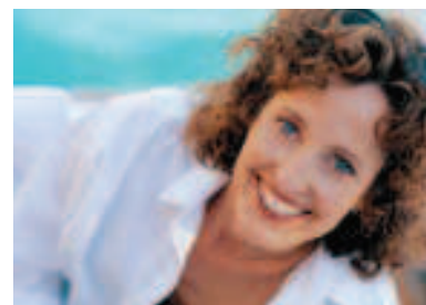
Chemically inert actives to fill wrinkles and give volume to hair

On the lip area results show a clear reduction in the depth of the lip wrinkles as well as a plumping effect on the lip surface. The colourless and odourless materials are based on fluorinated perfluorocarbons and are fully inert substances.